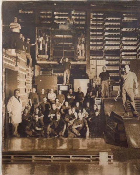
ABOVE: Only a few of the 1,000 odd ABET LAMINATI team